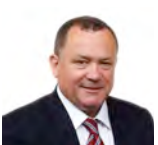
Lindsay Whittle Plaid Cymru South Wales East