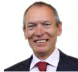
John Griffiths Welsh Labour Newport East