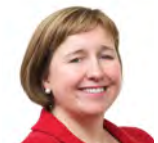
Lynne Neagle Welsh Labour Torfaen