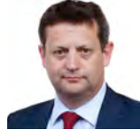
Alun Davies Welsh Labour Blaenau Gwent