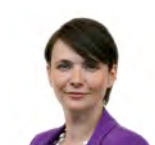
Kirsty Williams Welsh Liberal Democrats Brecon and Radnorshire