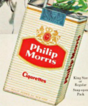
King Size or Regular Soap-open Pack

P ROUD mothers, please forgive us if we too feel something of the pride of a new parent. For new Philip Morris, today's Philip Morris, is delighting smokers everywhere. Enjoy the gentle pleasure, the fresh unfiltered flavor, of this new cigarette, born gentle, then refined to special gentleness in the making. Ask for new Philip Morris in the smart new package.